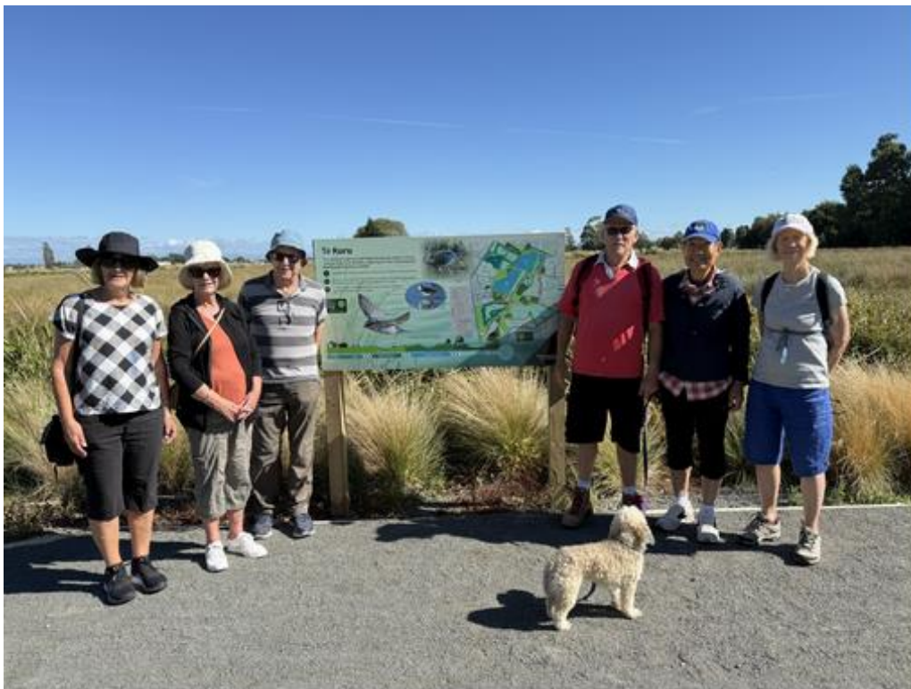
Not a cloud in the sky