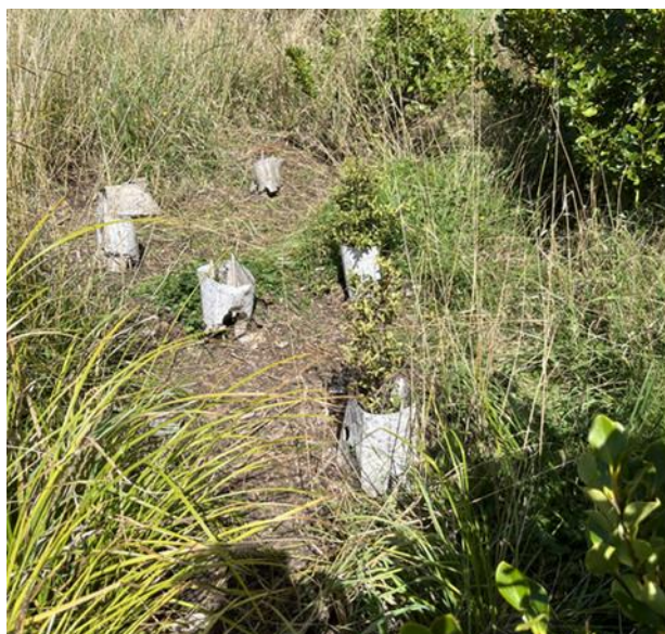
Part of the finished product

There certainly had been lots of growth since our last visit, but three of us ( Alan McK, Sara and Viv) did make some headway judging by the big pile of weeds. Lots of chat and a beautiful day did help lighten the load.