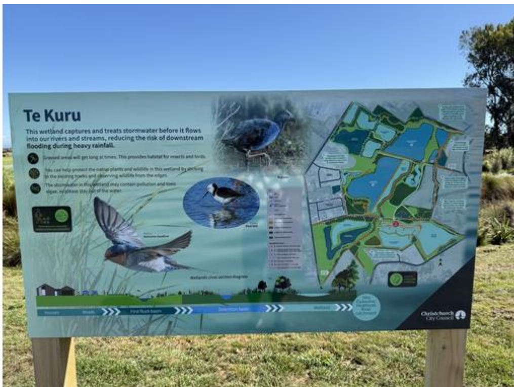
Just a closer look for thee.

Thanks to Viv for the activities reports and for the photographs.