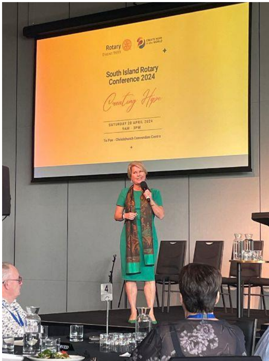
Jennifer Jones. Immediate Past Rotary International President.