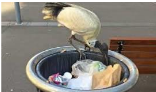
Ibis (bin chick)

Tonight's talk was a fascinating 'journey through' Aussie icons and was greatly received by the audience.